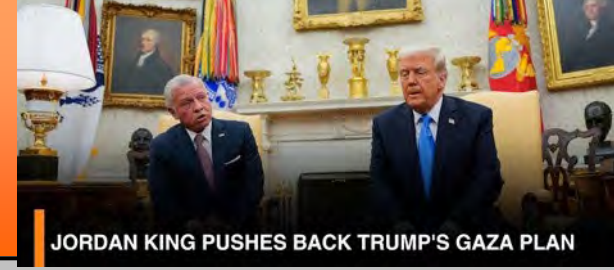
JORDAN KING PUSHES BACK TRUMP'S GAZA PLAN