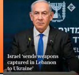
Israel 'sends weapons captured in Lebanon to Ukraine'