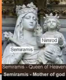
Semiramis - Queen of Heaven Semiramis - Mother of god