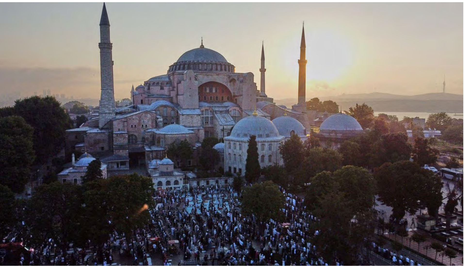
[2/2] People pray on the first day of Muslim holiday of Eid al-Adha outside the Ayasofya-i Kebir Camii or Hagia Sophia Grand Mosque in Istanbul, Turkey July 9, 2022.