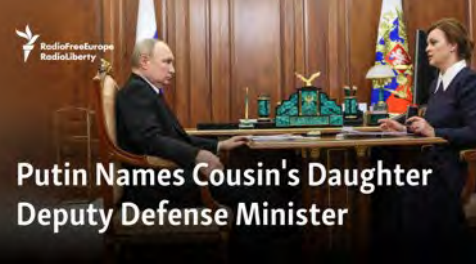
Putin Names Cousin's Daughter Deputy Defense Minister