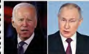
Biden taunts Putin You thought we'd roll over. You were wrong. Russia will never win