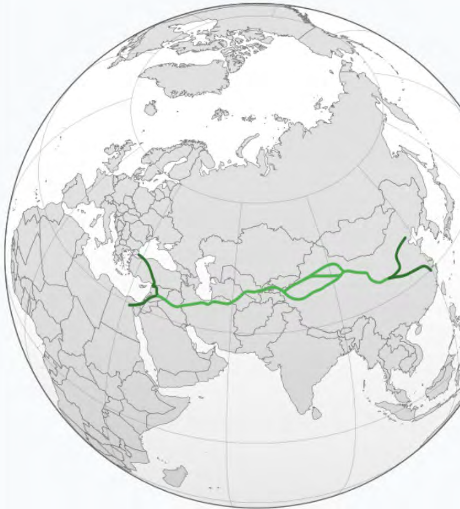
Main routes of the Silk Road