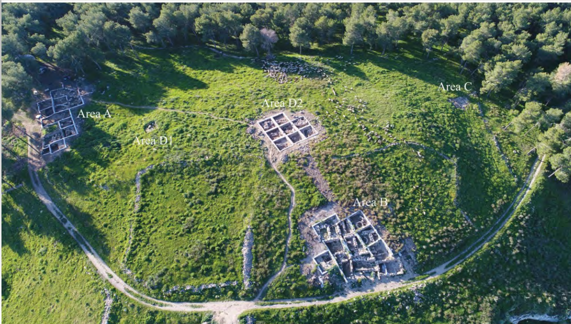
Fig. 2. Aerial photograph of Khirbet al-Ra'i. Area A is located on the left.