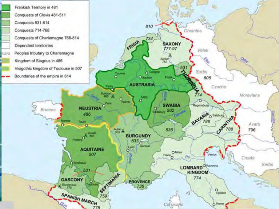
Carolingian Empire 481-814