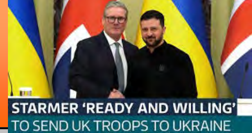
STARMER 'READY AND WILLING' TO SEND UK TROOPS TO UKRAINE