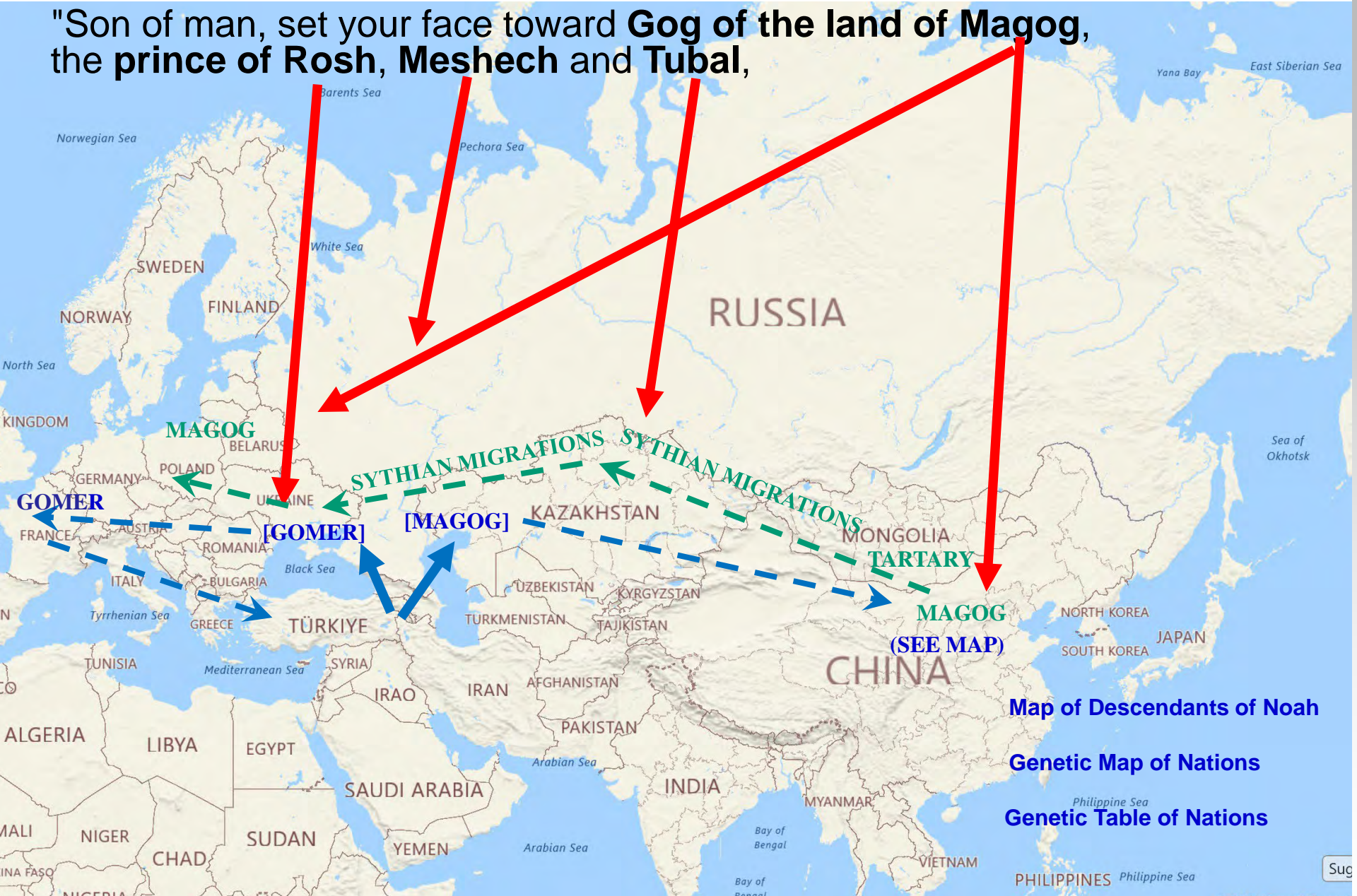
Map of Descendants of Noah

"Son of man, set your face toward Gog of the land of Magog, the prince of Rosh, Meshech and Tubal,