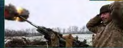
RUSSIA-UKRAINE WAR: WEAPONS INDUSTRY BOOMS

EVENT Eastern Europe's arms industry is churning out guns, artillery shells and other military supplies at a pace not seen since the Cold War as governments in the region lead efforts to aid Ukraine in its fight against Russia. Allies have been supplying Kyiv with weapons and military equipment since Russia invaded its neighbour on Feb. 24, depleting their own inventories along the way. The United States and Britain committed the most direct military aid to Ukraine between Jan. 24 and Oct. 3, a Kiel Institute for the World Economy tracker shows, with Poland in third place and the Czech Republic ninth. Still wary of Russia, their Soviet-era master, some former Warsaw Pact countries see helping Ukraine as a matter of regional security. But nearly a dozen government and company officials and analysts who spoke to Reuters said the conflict also presented new opportunities for the region's arms industry.